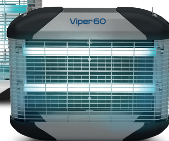
Viper 60 Catcher ILT 4x15W Lamps