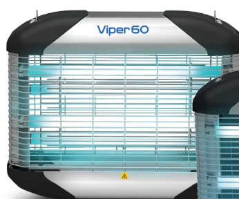
Viper 60 Killer ILT 4x15W Lamps