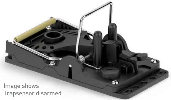
Image shows Trapsensor disarmed